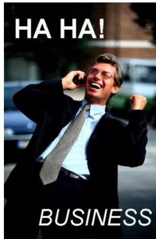
Figure: The business expert of Awesome Cloud AG