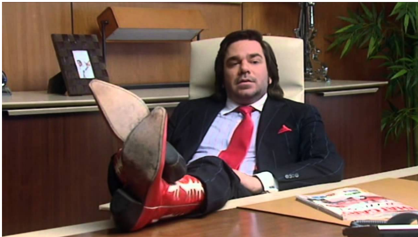
Figure: The visionary CEO of the LowTech GmbH